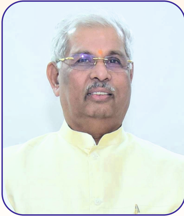
Hon'ble Shri Rajendra Vishwanath Arlekar Chancellor-cum-Governor of Bihar