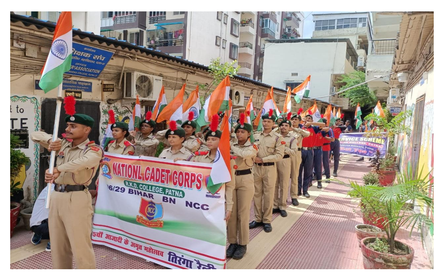
9. ON THE EVENT OF PPU ORGANIZED YOUTH CONCLAVE BY PPU ON DATE 15 OCT 2022. CADET STRENGTH – SD: 20 SW: 10 TOTAL: 30

CADET STRENGTH – SD: 15 SW: 10 TOTAL: 25